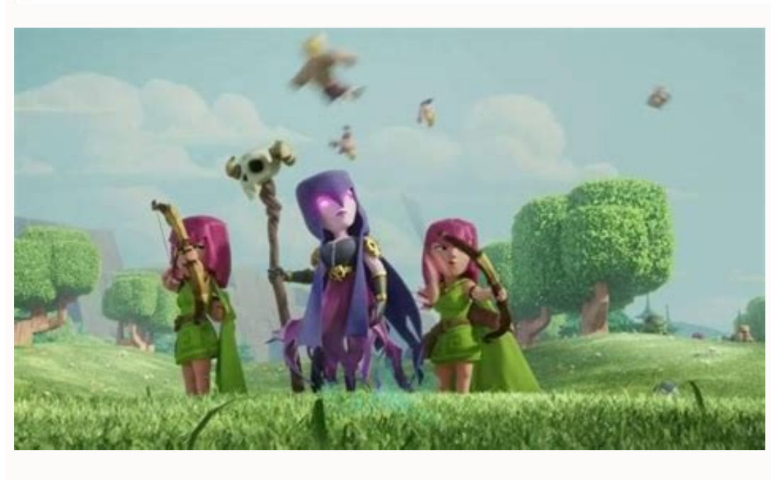
Apps to get free gems on clash royale. How to get free gems in clash royale without downloading apps. Can you get free gems in clash royale.